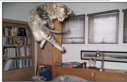
there's no slowing me down!