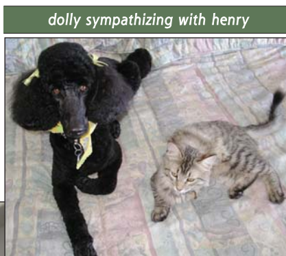
dolly sympathizing with henry