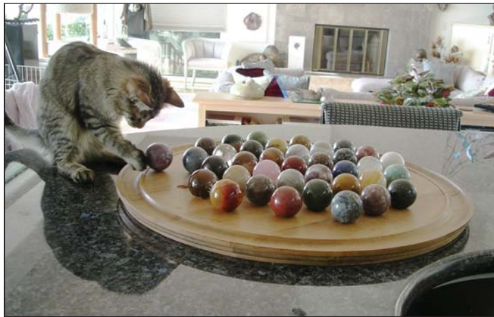
having a ball at home